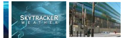
Global Edmonton's weather forecast for Wed, Jan 18.